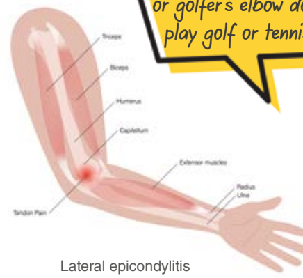
Lateral epicondylitis Tennis elbow

Our newsletter is free! You can take a copy with you.